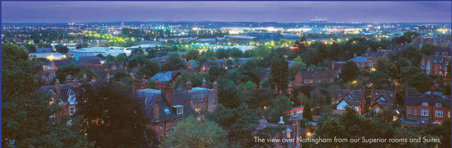
The view over Nottingham from our Superior rooms and Suites